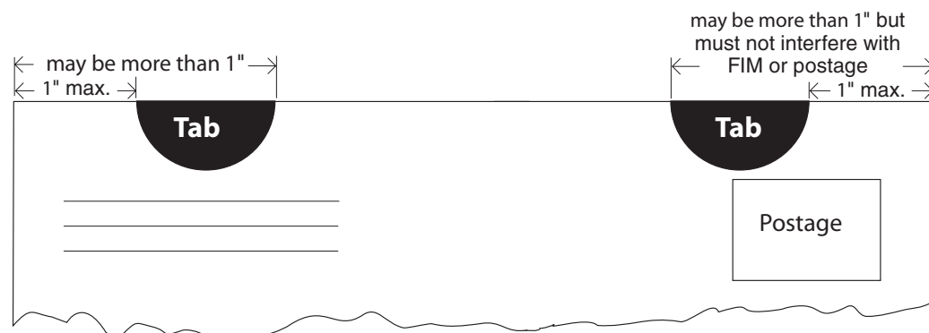
Exhibit 3.14.1b Sealing the Top Edge With Fold at the Bottom