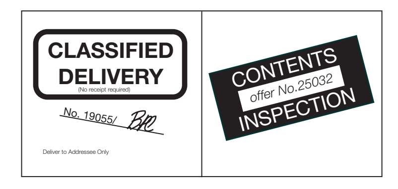
Exhibit 1.5 Prohibited Imitations

Matter bearing decorative markings and designs, in adhesive or printed form, resembling the markings and designs of official postal services, is not accepted for mailing (see Exhibit 1.5).