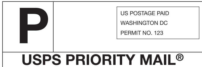
Exhibit 3.1 Priority Mail Service Indicator